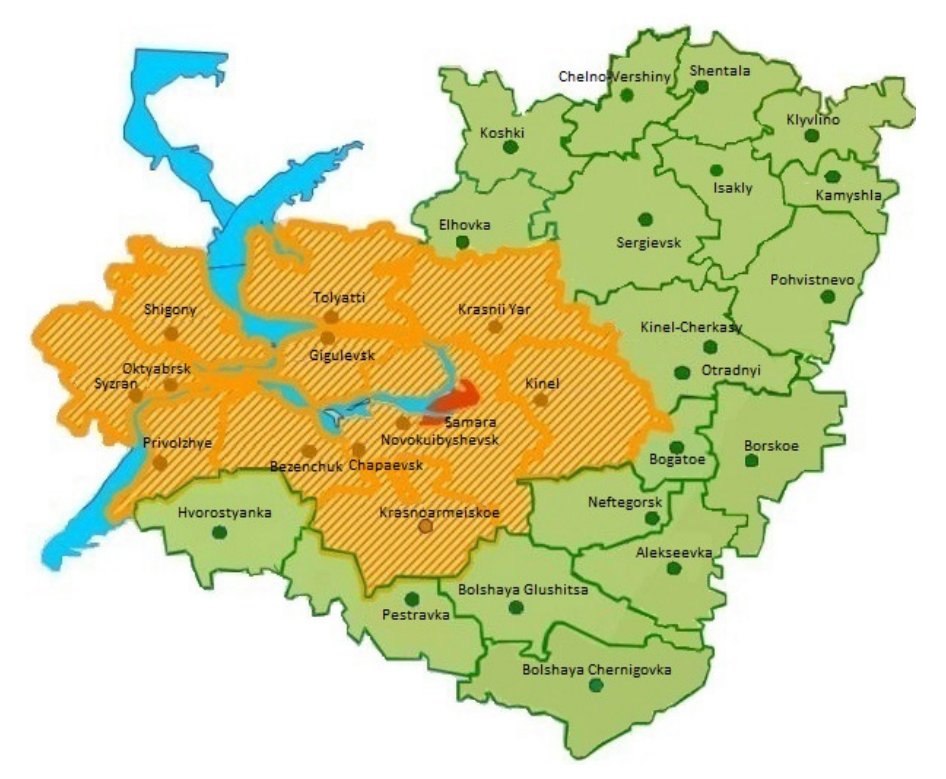
Fig. 1. Territory of Samara-Tolyatti agglomeration

of municipal districts. With increase in the total area of arable land, in the region remains the problem of loss of especially valuable and fertile land.