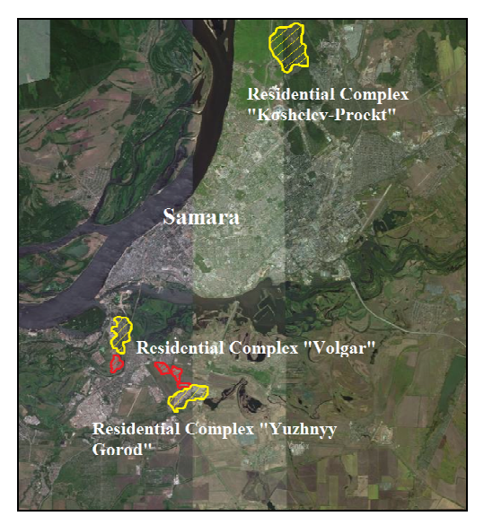
Fig. 3. Existing (in yellow) and planned (in red) build-up areas used for agriculture

Currently Government of the Russia is paying attention to improvement of legal regulation of land relations. Ministry of Economic Development of the Russia has prepared plan for future activities, there have been planned: